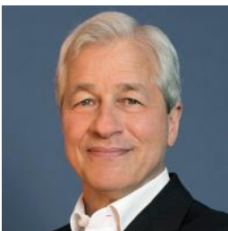
Jamie Dimon Chair & CEO, JPMorgan Chase

Prior to being named NYSE President, Cunningham served as NYSE Chief Operating Officer and has held several senior positions at global exchanges. Cunningham has a degree in Industrial Engineering from Lehigh University, and currently sits on the Board of Directors for Catalyst and the Partnership for New York City.